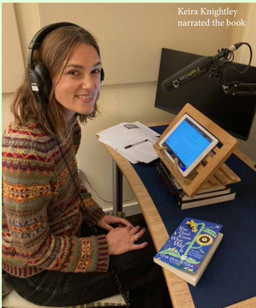
Keira Knightley narrated the book

How can I be happy when my friends are there and I worry about them and their safety?